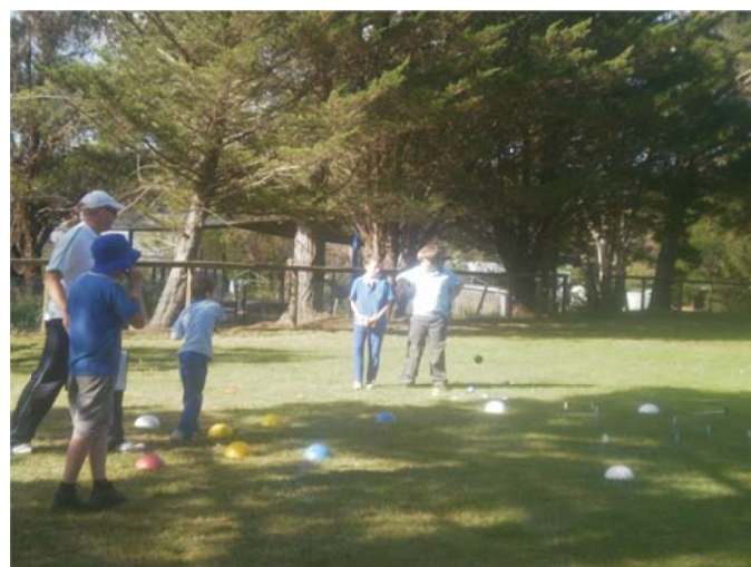
Shot put trials